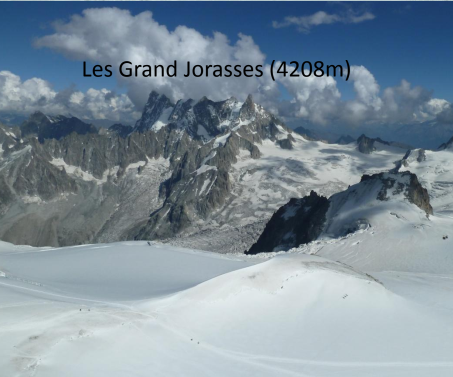
Les Grand Jorasses (4208m)