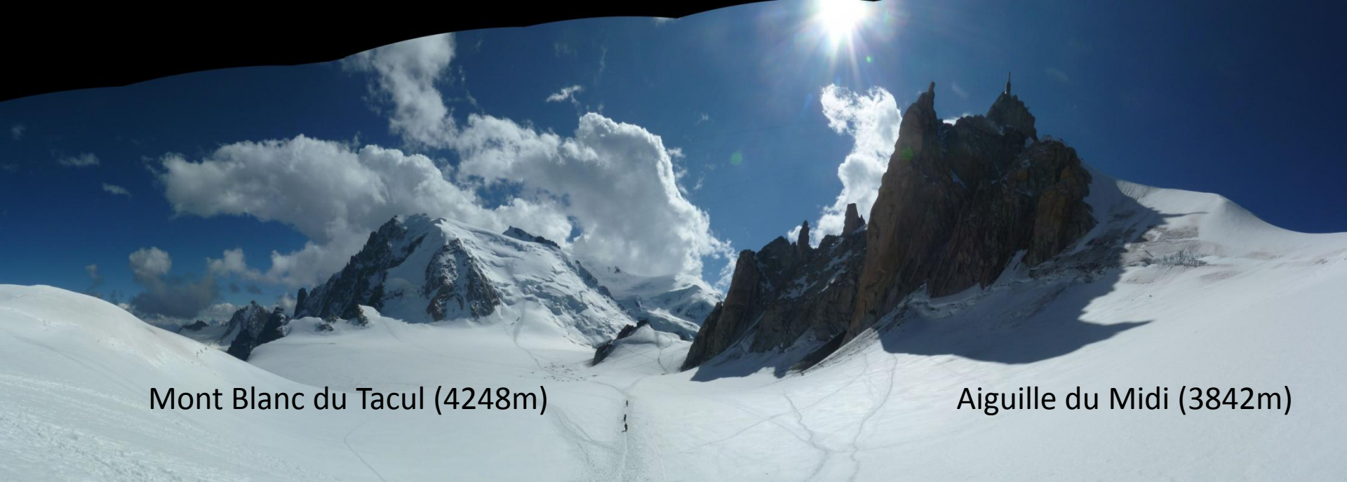
Mont Blanc du Tacul (4248m)